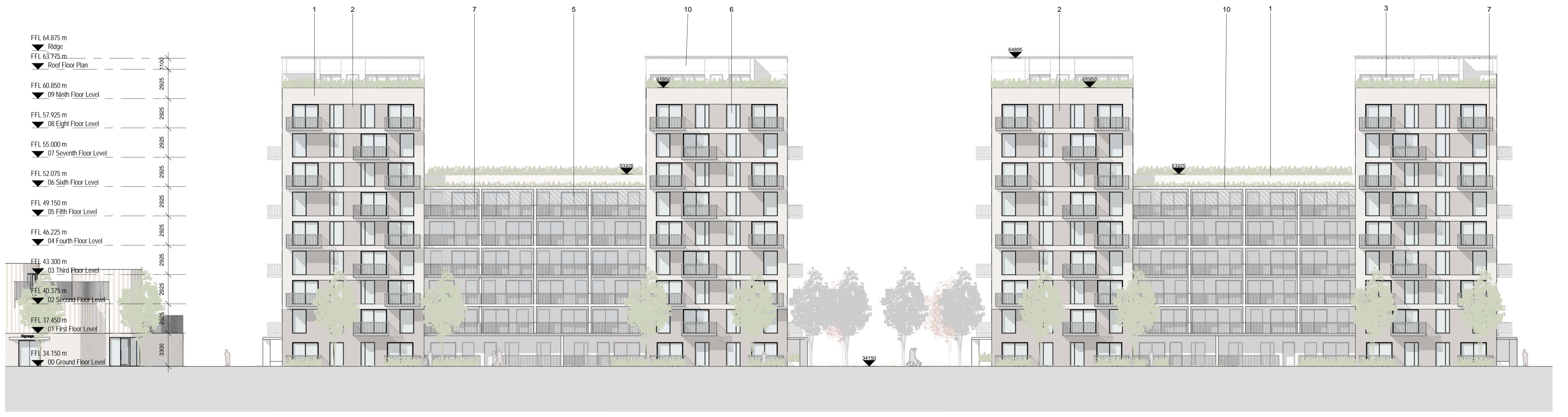
2 Elevation SW 1 : 200

NOTES: Copyright of this drawing is vested in the Architect and it must not be copied or reproduced without consent. Figure dimensions only are to be taken from this drawing. All dimensions must call out and be responsible for taking and checking all dimensions relate most with. Plus Architecture is to be advised of any variation between drawings and site conditions. DO NOT SCALE OFF THIS DRAWING. IF IN DOUBT ASK