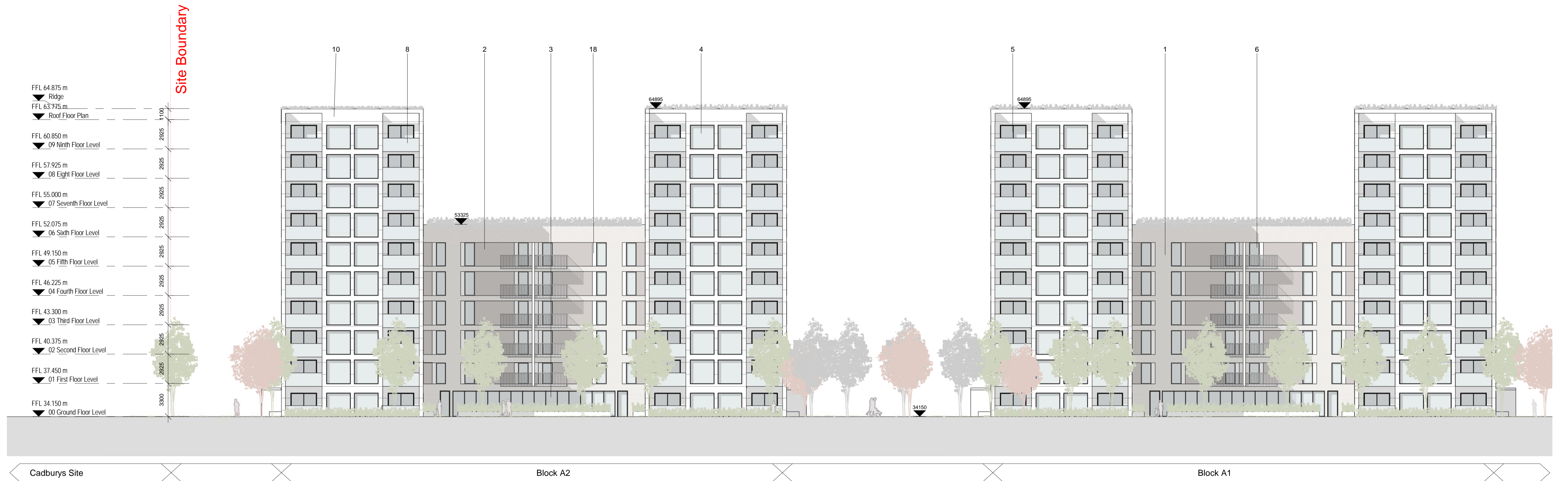
1 Elevation NE 1 : 200